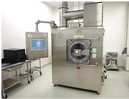
Thomas 48" Accela-Cota Compu-Coat 6 System, Turnkey w/ AHU