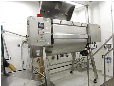
A&M Process Stainless Steel Ribbon Blender