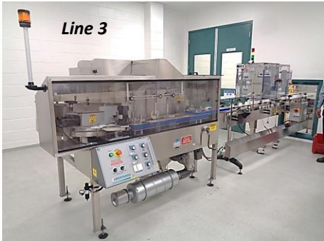
(1 of 3) Cremer 24 & 12 Lane Solid Dose Packaging Lines. Fully automated, late vintage, still installed and operational.