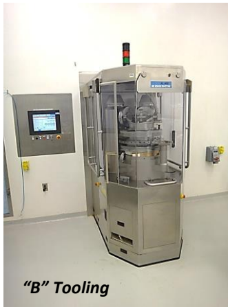
"B" Tooling Korsch XL400FT 35 Station Tablet Press