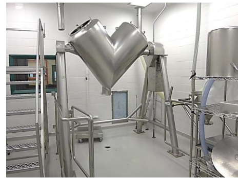
"PK" Type 20 CUFT Stainless Steel Twin Shell Blender