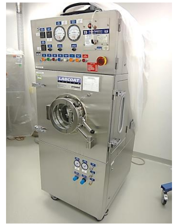
O'Hara LC1 Automatic Coating Pan