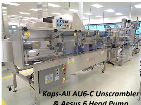
Aesus Liquid Packaging Line (50ml to 4L) Fully automated, late vintage, still installed and operational.