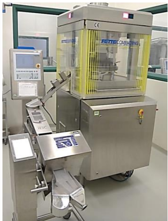
(1 of 3) Fette 1200 & 1200i 24 Station Tablet Presses