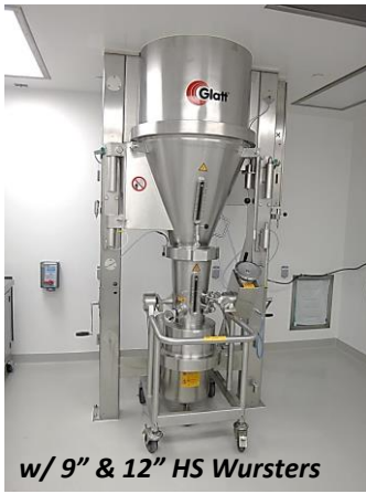
w/ 9" & 12" HS Wursters Glatt GPCG-5 Pro Fluid Bed Processor