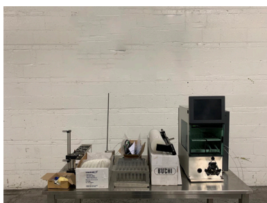
Lot 3: Buchi Flash Chromatography Unit, Model C-810