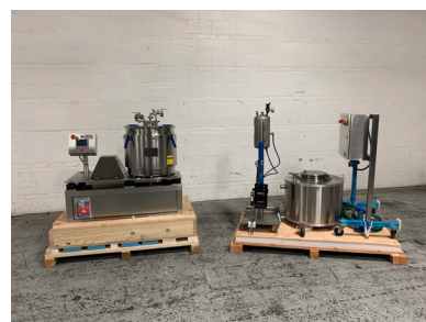
Lot 5: 19" x 18" Delta Separations Centrifuge, Model CUP30