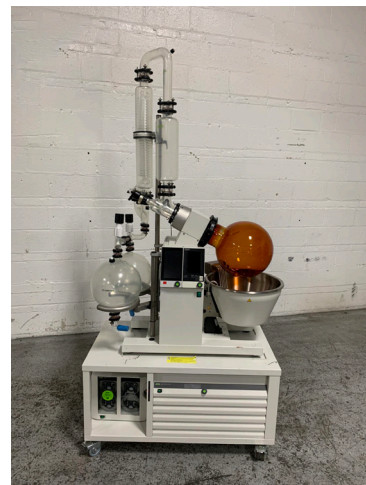
Lot 2: Buchi RotoVap Evaporator, Model R-220 Pro