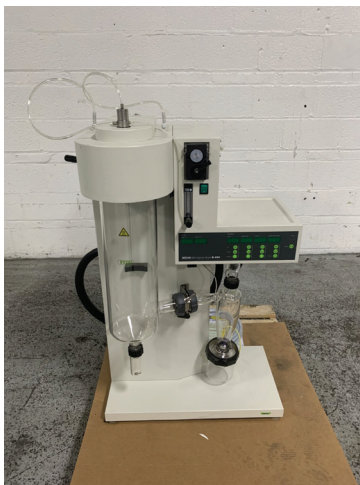
Lot 1: Buchi Mini Spray Dryer, Model B-290