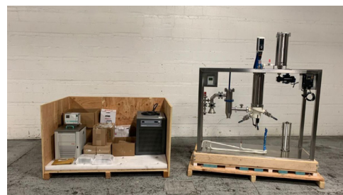
Lot 7: Delta Separations Rolling Film Distillation, Model RFD-27