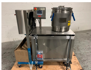
Lot 4: 13" x 14" Delta Separations Centrifuge, Model CUP15