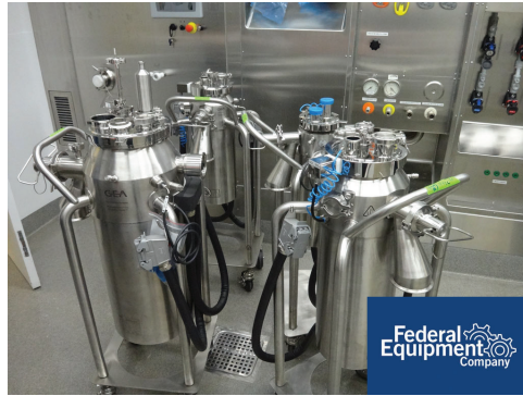
SKU: 3511-39 GEA Niro High Shear Granulator, Model PharmaConnect