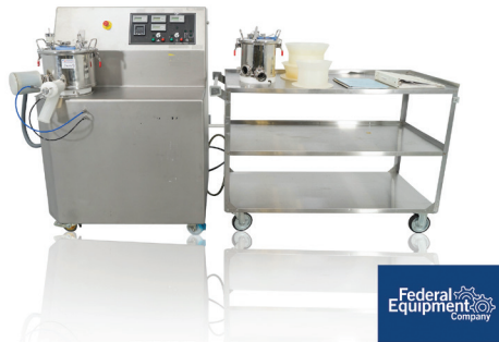
SKU: 3511-166 GEA Niro Pharma Systems High Shear Processor, Model PMA-1