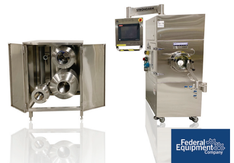
SKU: 3511-16 O'Hara LabCoat Coating Pan, Model LC1

Contact: Adam Covitt adam@fedequip.com +1 216 536-0312