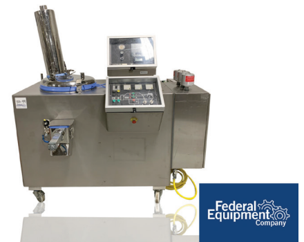
SKU: 3511-49 150 Liter TK Felder High Shear Mixer, Model PMA150