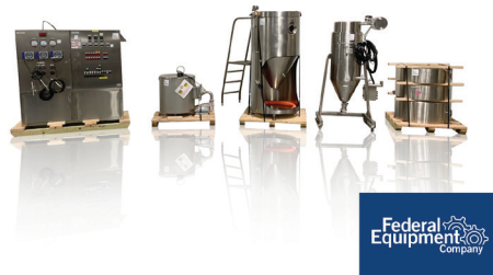
SKU: 3511-1 GEA Niro Mobile Minor Spray Dryer, S/S