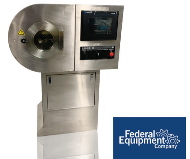
SKU: 3511-50 Vector Hi-Coater Coating Pan, Model LDSC3

Contact: Adam Covitt adam@fedequip.com +1 216 536-0312