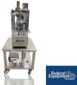
SKU: 3511-31 Riva Piccola Tablet Press, Model B10