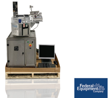
SKU: 3511-25 Capsugel Xcelodose 600 Capsule Filler