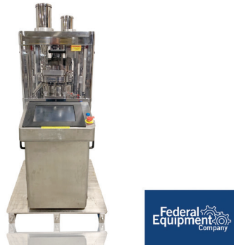
SKU: 3511-28 Riva Piccola Bi-Layer Tablet Press, Model P1-DC-B11-3C