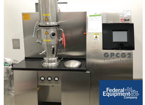
SKU: 3511-12 Glatt Fluid Bed Dryer Granulator, Model GPCG2